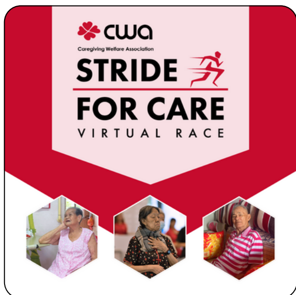
Stride For Care 2025