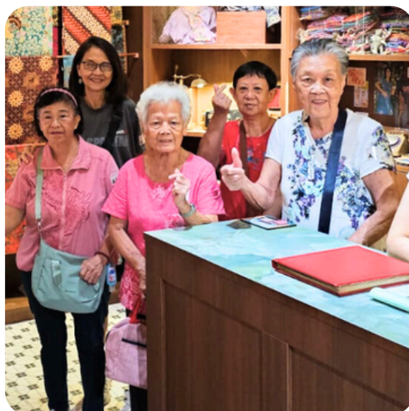
Peranakan Museum Seniors' Outing